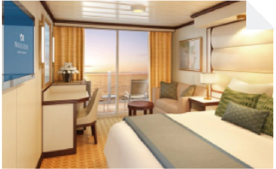
Standard Balcony Room