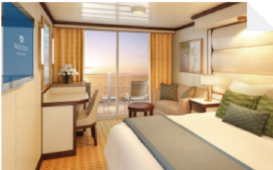
Standard Balcony Room